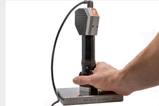
INDIRECT CALIBRATION USING A HARDNESS TEST BLOCK